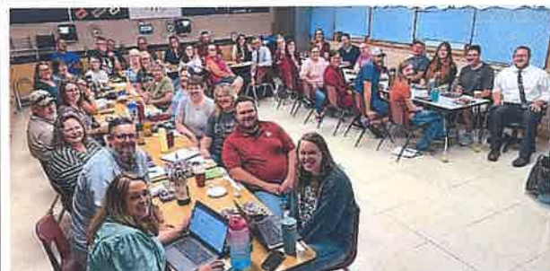
OUR AWESOME STAFF PARTICIPATING IN PROFESSIONAL LEARNING AND COLLABORATION ABOUT THE VISION AND MISSION OF LEYTON PUBLIC SCHOOLS.